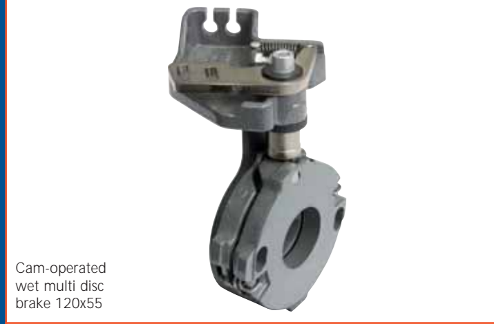
Cam-operated wet multi disc brake 120x55