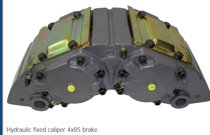
Hydraulic fixed caliper 4x85 brake