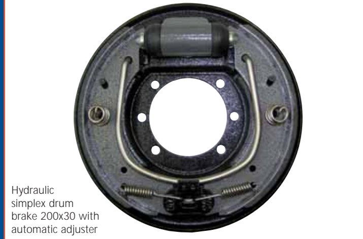
Hydraulic simplex drum brake 200x30 with automatic adjuster

Knott may claim with some justification to be THE specialist in brakes and braking systems for all kinds of forklift. Because at Knott, every brake is developed in cooperation with the customer precisely to meet the needs of the specific truck requirements and work load. The type of application, environmental conditions and the duty demands made on the truck in question alone decide the design principle, the structure and the performance of the brake or braking system. Knott's specific field of specialist expertise lies in the production of medium to small brake lot size volume.