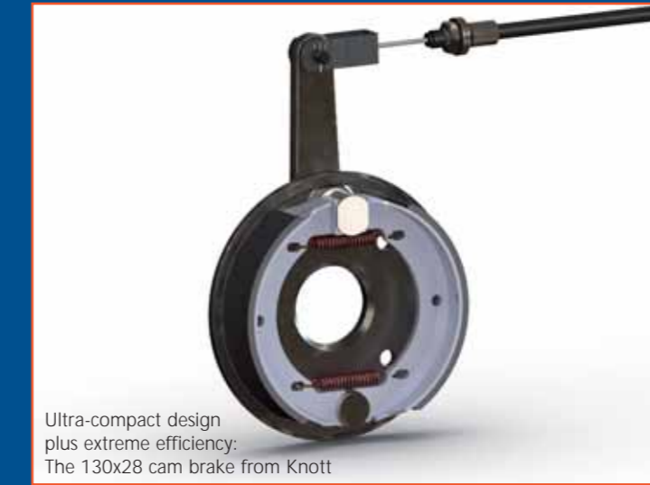
Ultra-compact design plus extreme efficiency: The 130x28 cam brake from Knott