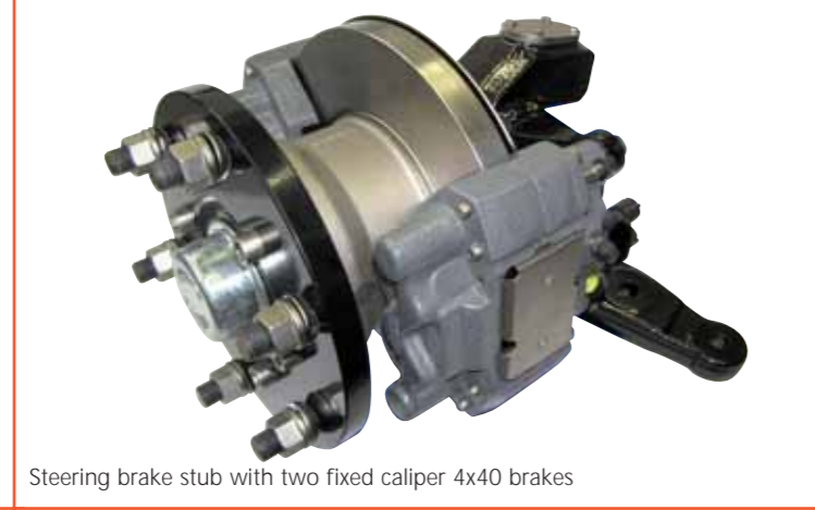
Steering brake stub with two fixed caliper 4x40 brakes