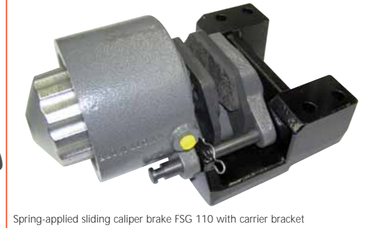
Spring-applied sliding caliper brake FSG 110 with carrier bracket

Knott brakes adapt perfectly to the special requirements of industrial trucks, ensuring impressive performance in terms of • high duty capacity • consistent output • high braking efficiency and operator braking refinement • long service life • exemplary ease of maintenance functions